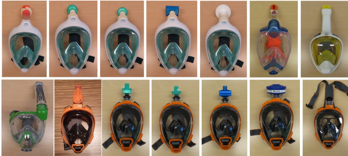
Figure 1. Snorkel mask configurations tested