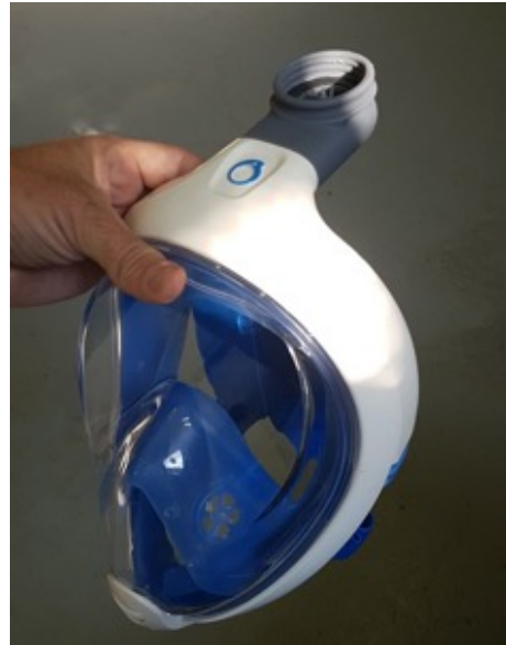
Figure 4 - Easybreath by Decathlon with Adaptor.