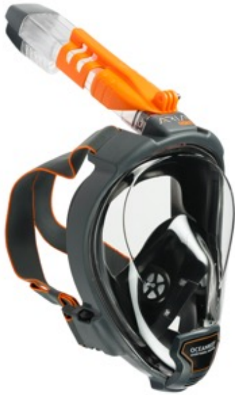
Figure 3 - Aria QR+ mask from OCEAN REEF.