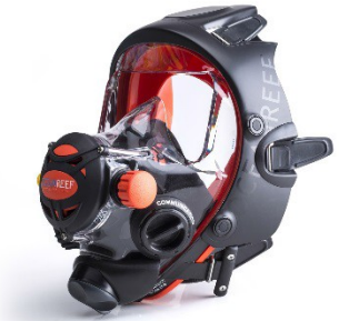
Space Extender - Black/Orange (Medium/Large OR025105)