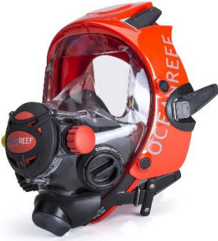
Space Extender - Orange/Orange (Medium/Large OR025108)