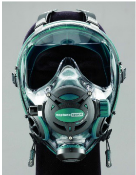
G.divers - Emerald (M/L OR025017; S/M OR025018)