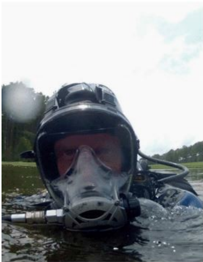
Neptune Space Full Face Mask 50/60 PSI (33366; 33367)