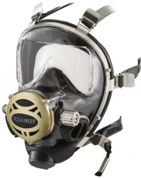
Predator (S/M 33368; M/L 33369)