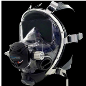
Predator t-divers (OR030004)