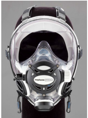
G.divers – White (M/L OR025011; S/M OR025012)