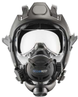
Space Extender - Black/Black (S/M OR025102; M/L OR025103)