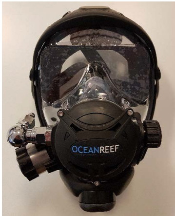
Neptune Space Extender w/visor light (OR025106)