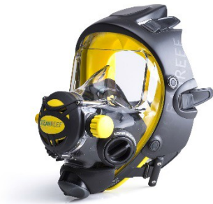
Space Extender - Black/Yellow (Medium/Large OR025104)