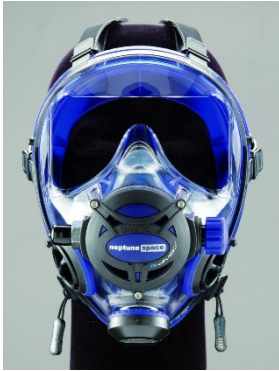
G.divers - Colbalt (M/L OR025015; S/M OR025016)