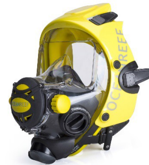
Space Extender - Yellow/Yellow (Medium/Large OR025107)