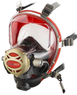
Iron Mask (OR025021)