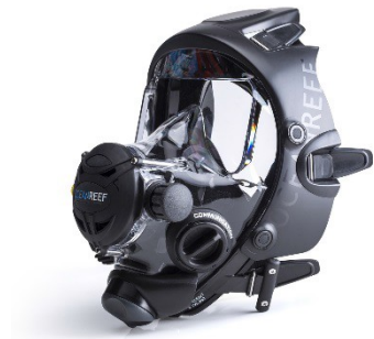
Space Extender 100 - IDM - Black/Black 100% O2 compatible (M/L OR025101; S/M OR025100)