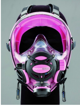
G.divers – Pink (M/L OR025013; S/M OR025014)