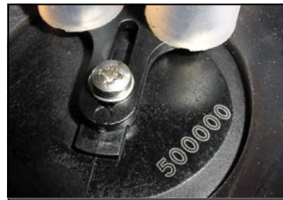
Neptune Space serial number