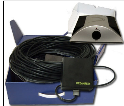
Underwater Speaker System

This is a special order item, so contact Ocean REEF or your sales rep for details.