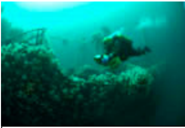
The SS Rosecastle