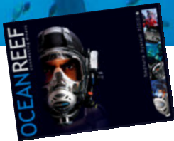
2006 Catalogs now available!