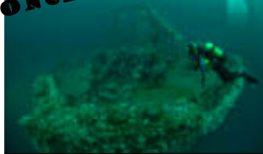
The SS Rosecastle