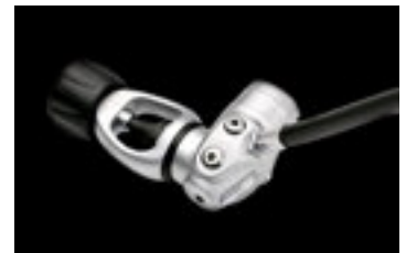
1st stage SL 35 TX